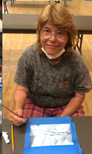
Top to Bottom: Game Night, Beginning Watercolor, Mixed Media Studio Time